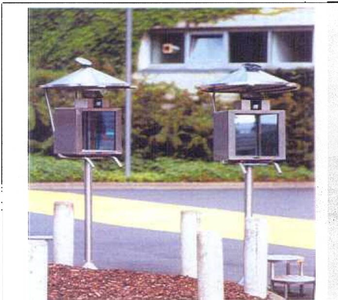
Picture 3: Two True Mirrors await new viewers at the Expo 2000, Hannover, Germany