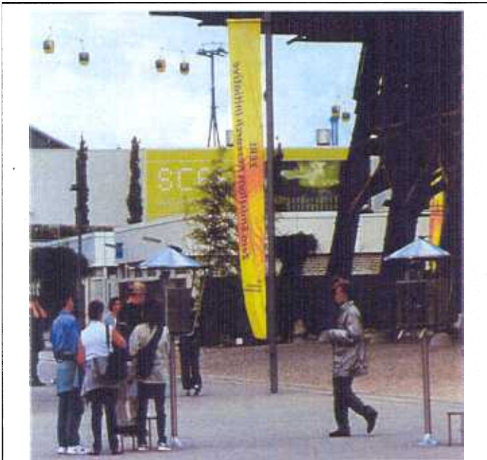
Picture 1 - True Mirrors in the shadow of one of the great pavilions, Expo2000, Hannover, Germany

Note: These photos and many other scenes of Expo 2000 are available in digital format upon request.