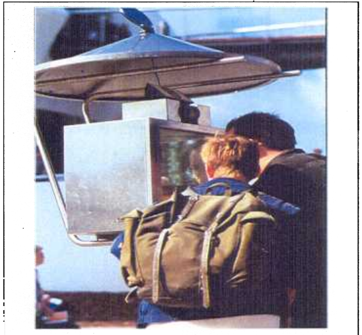
Picture 2 - Two visitors peer closely at their new True Mirror images, Expo 2000, Hannover, Germany